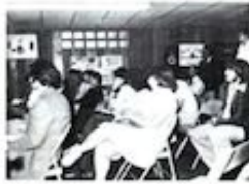
Some of the Madison Kirby Organization.