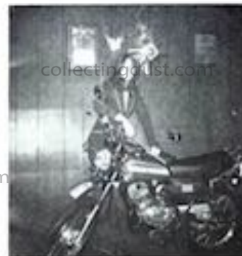
Chris Lobos winning the motorcycle drawing.

Thought for the day: If you like animals, you'll like our salesmen.