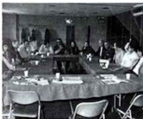
Part of the Madison Organization.