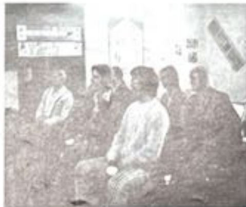
Sales meeting at Kirby Company, Schofield North.