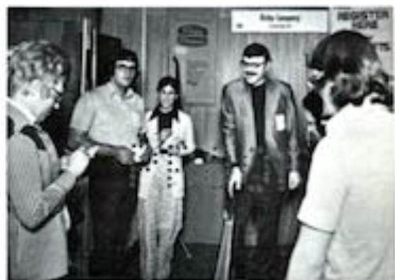
Part of the Crystal Lake crew registering prospects at the "Home Improvement Show".

GOOD LEADERS inspire others with confidence in them; GREAT LEADERS inspire them with confidence in themselves.