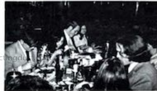
Kirby Banquet - March 29, 1975.