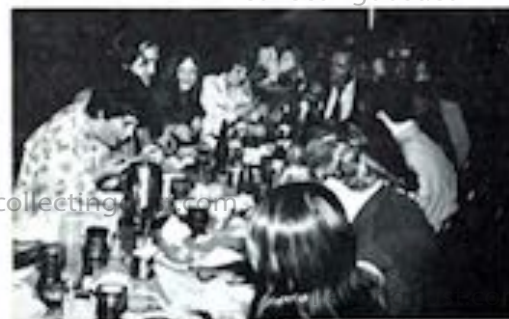
Kirby Banquet, March 29, 1975. Eating all those steaks.