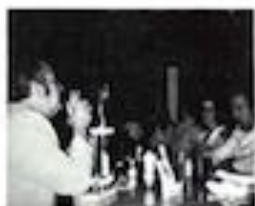
The Superior group at the banquet at Stewart's Lodge in Iron River.