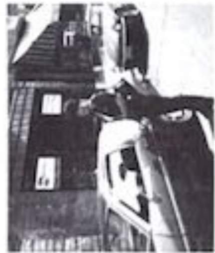
Kirby is great for those who work John with new car parts it.