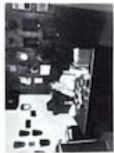
Our morning phone girl, Donna. "Keep those appointments coming in".