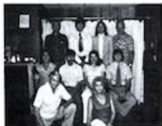
Good group of Tigers.