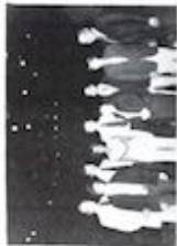
The Milwaukee group along with our Supervisor. What a good looking group.