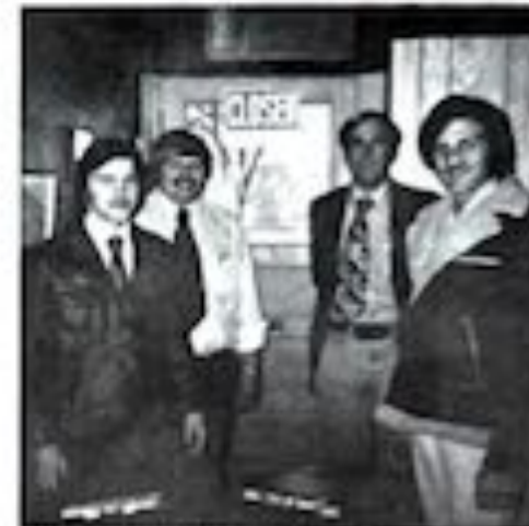
Part of Appleton Sales Crew.