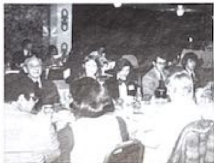
Pop with some of his Kirby friends.

We are back to work. August will be dedicated to mass production.