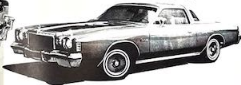
1976 CHRYSLER CORDOBA

IT'S THE "DOUBLE Q" CAMPAIGN FOR "DOUBLE C'S" CONTINENTALS & CORDOBAS