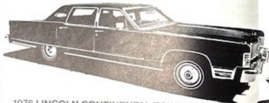
1976 LINCOLN CONTINENTAL TOWN CAR