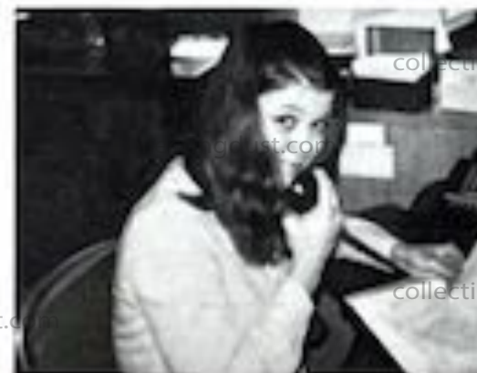
Gigi says she doesn't want a pie in the eye, so I'll make appointments too.