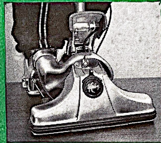
Position of the belt lifter when belt is driving brush.

properly placed, the lip in the center of the nozzle top will slide under the nozzle latch or cam lock, provided the end of the latch lever rests on the protruding pin located next to it. Lift the handle of the cam off the pin and rotate to the right as far as it will go, pressing the handle of the cam snugly. Turn the name-plate lever until it is vertical and the name "Kirby" is in a readable position.