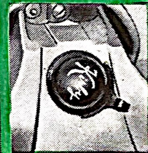
Position of the belt lifter when belt is lifted from shaft.

THE BELT LIFTER . . . A steel finger lifts the belt effortlessly when the name-plate cap lever is turned. See the illustrations for positions.