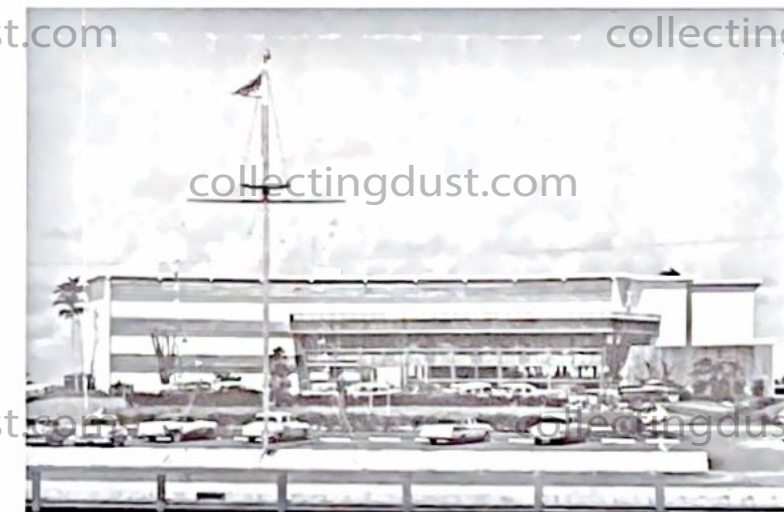
THE BAREFOOT MAILMAN HOTEL - ANOTHER UNIQUE AND FAMOUS HOTEL WHICH YOU WILL VISIT AS A WINNER

Your personal sales can also qualify you as one of the "Kirby Seventy" at the Birthday Celebration which will climax your week-long, all-expense-paid vacation in Ft. Lauderdale with your wife. No quotas, no organizational restrictions. Just be one of the top seven salesmen during the campaign, and you will be flying to Florida next April with the other winners.