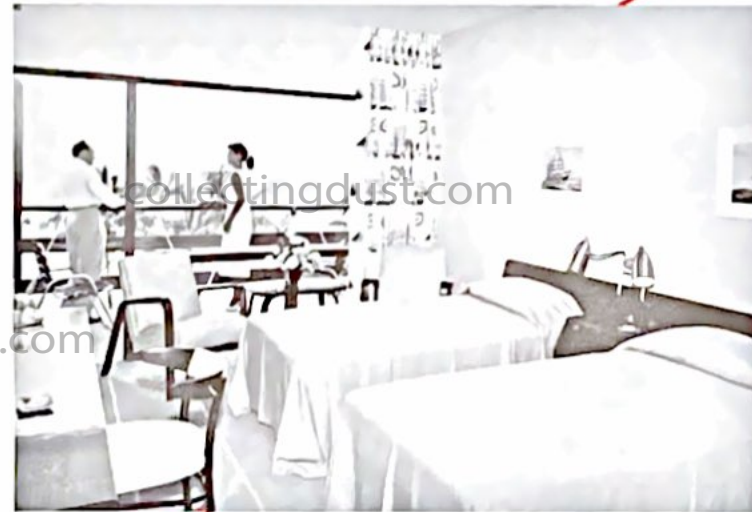
YOUR ROOM AT THE YANKEE CLIPPER