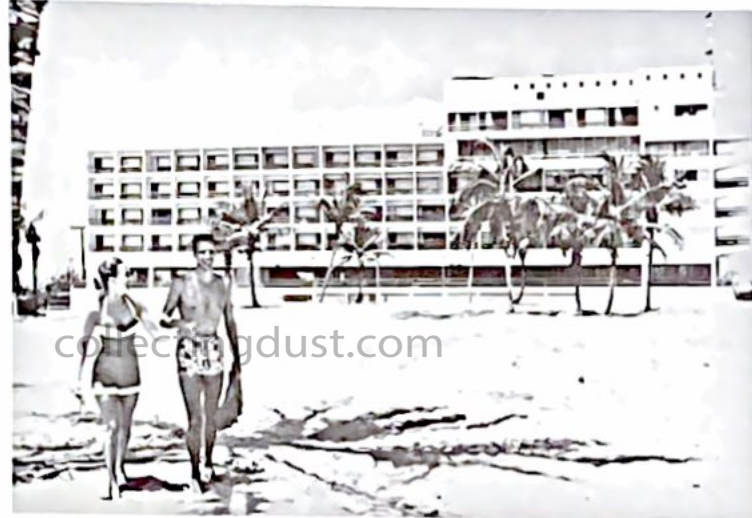
SAND 'N' SUN AND LOTS OF FUN

Buddy Sponsors, 178 of them, will share this handsome bundle of cash. The cash you will receive as a winning Sponsor will depend on how many Buddies you have, how quickly you get them, and how effective you are in helping them get started. The more sales your Buddies make, the more points you will receive. The cash prize you win will depend on your total points, and you can win anywhere from $100 to $1000.