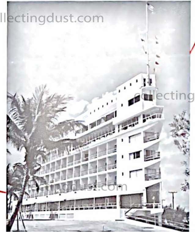
THE NEW AND MODERN YANKEE CLIPPER HOTEL FORT LAUDERDALE, FLA.